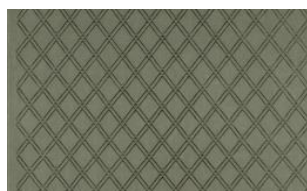
Bergwind 030 *