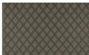
Bergwind 041 *