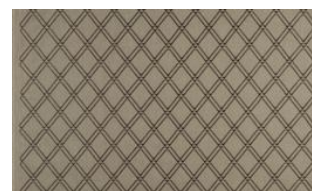
Bergwind 040 *