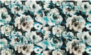
Frida o89 °