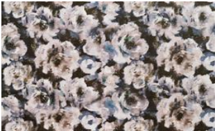
FRIDA o88 °