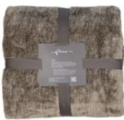
Melli 111 blonde - throw