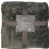
Melli 130 olive - throw