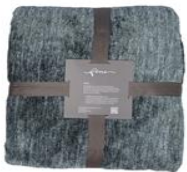
Melli 181 petrol - throw