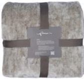
Melli 110 beige - throw