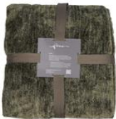
Melli 131 green - throw