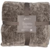
Melli 140 taupe - throw