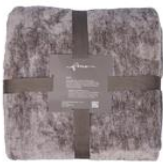
Melli 180 lavender - throw