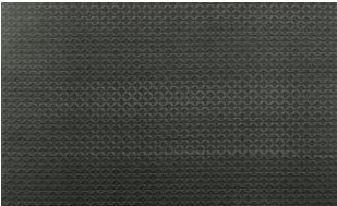
Mini Rhomb 041