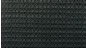
Mini Rhomb o70