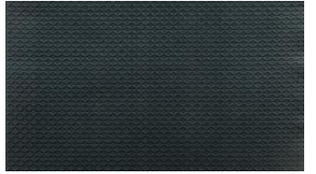
Mini Rhomb o81