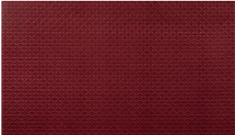
Mini Rhomb o50