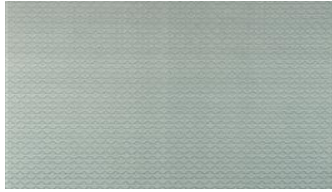
Mini Rhomb o80