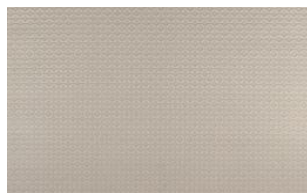
Mini Rhomb o10