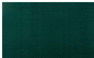
Mini Rhomb o31