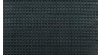
Mini Rhomb 081