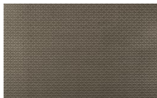
Mini Rhomb o40