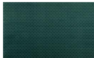
Mini Rhomb o32