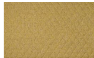
Samy Rhomb 020