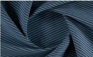
Softly Dot 082