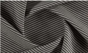
Softly Dot 081