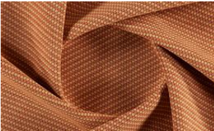
Softly Dot o60