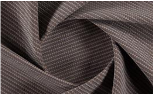
Softly Dot o40