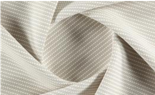
Softly Dot o10