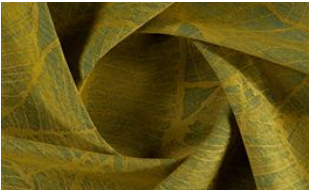
Softly Leaf 031