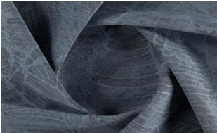
Softly Leaf 081