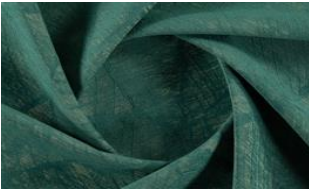
Softly Leaf 032