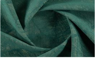
Softly Leaf 032