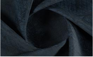
Softly Leaf 080