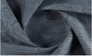
Softly Leaf 081