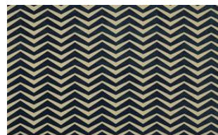
Zig Zag 081