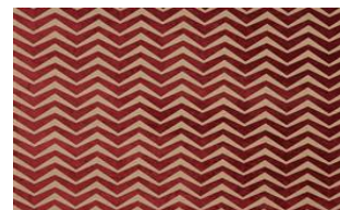
Zig Zag 050