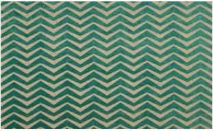
Zig Zag 080