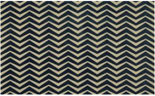
Zig Zag 081