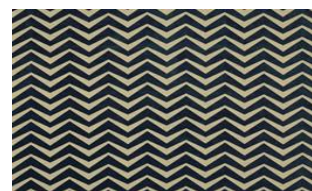
Zig Zag o81