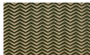
Zig Zag o30