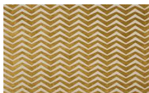
Zig Zag o20