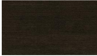
Chiaro Plain 042