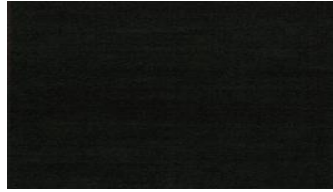
Chiaro Plain 043