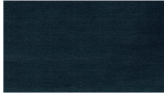
Chiaro Plain 080