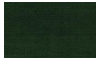
Chiaro Plain 031