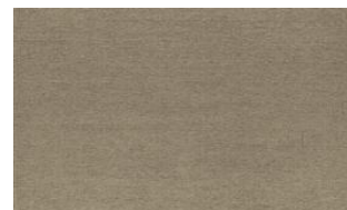
Chiaro Plain 040