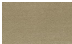
Chiaro Plain 010