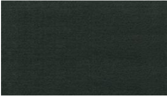
Chiaro Plain 070