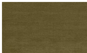
Chiaro Plain 030