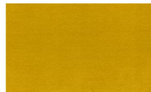
Chiaro Plain 020