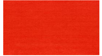
Chiaro Plain 060