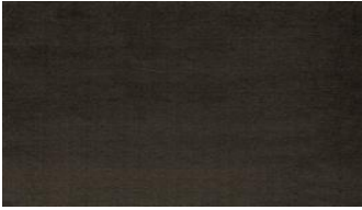
Chiaro Plain 041