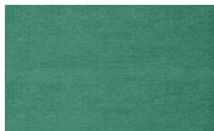
Chiaro Plain 032