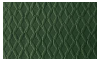
Luca Rhomb 030