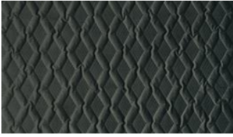
Luca Rhomb 070