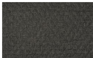
Samy Rhomb 070