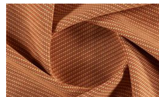
Softly Dot 060