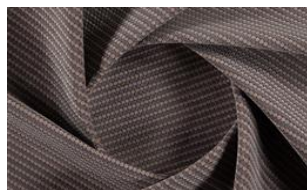
Softly Dot 040