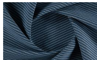
Softly Dot 082