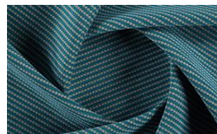
Softly Dot 080