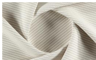
Softly Dot 010