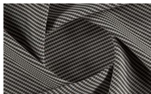
Softly Dot 081