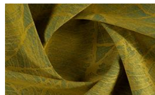
Softly Leaf 031