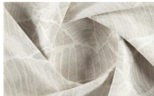
Softly Leaf 010