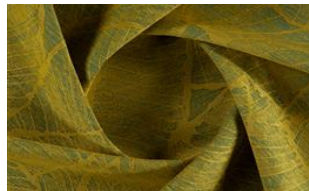
Softly Leaf 031