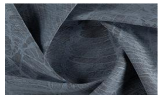
Softly Leaf 081