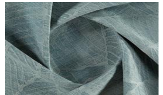
Softly Leaf 030