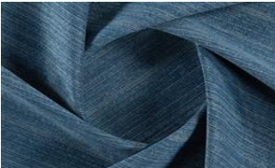
Softly Stripe 081