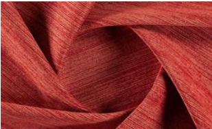
Softly Stripe 050