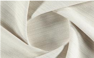
Softly Stripe 010