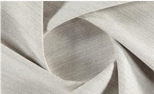
Softly Stripe 011