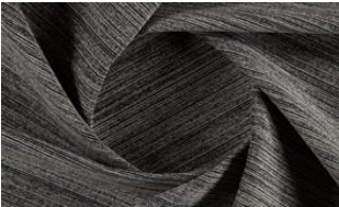
Softly Stripe 080